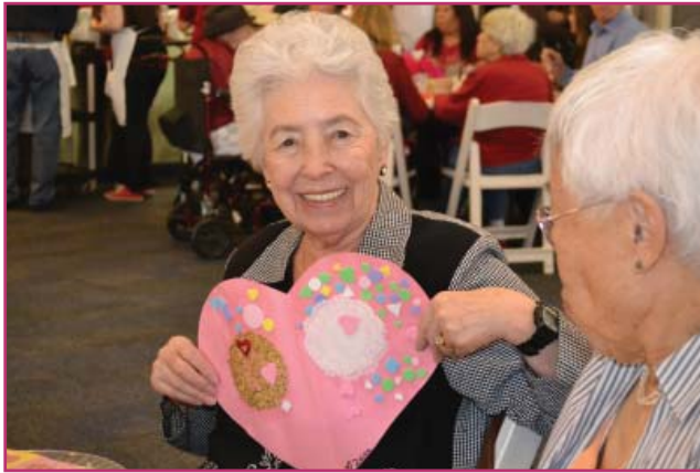
2013 Valentine Luncheon