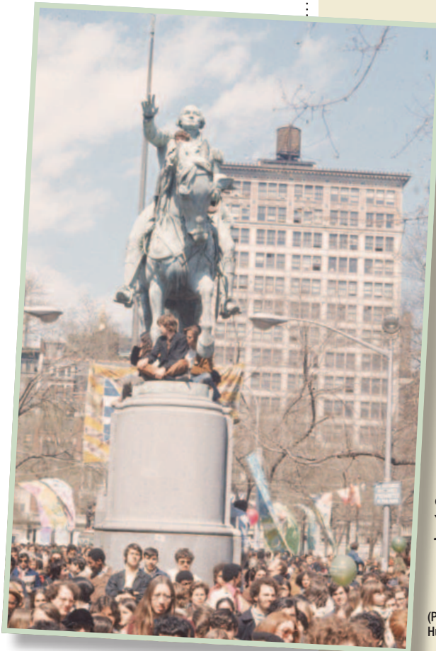
Crowds gather by a George Washington statue in Union Square for an Earth Day celebration in New York City, April 22, 1970.

Earth Day: The History of a Movement www.earthday.org/earth-day-history-movement