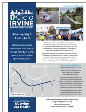
Business Opportunity Flier